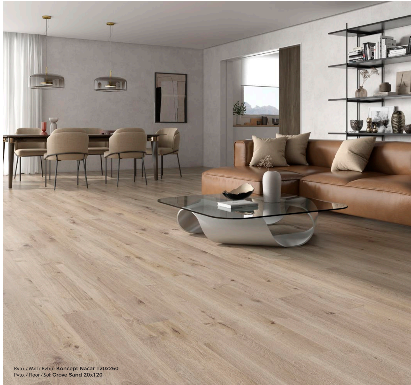
Rvto. / Wall / Rvtm.: Koncept Nacar 120x260 Pvto. / Floor / Sol: Grove Sand 20x120