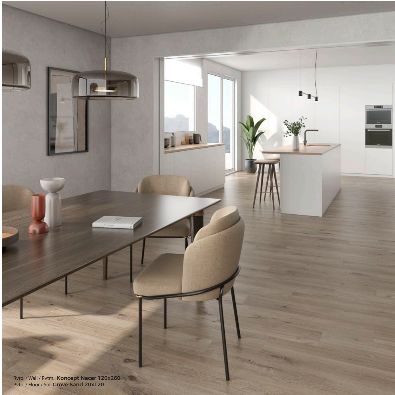
Rvto. / Wall / Rvrm.: Koncept Nacar 120x260 Pvto. / Floor / Sol: Grove Sand 20x120