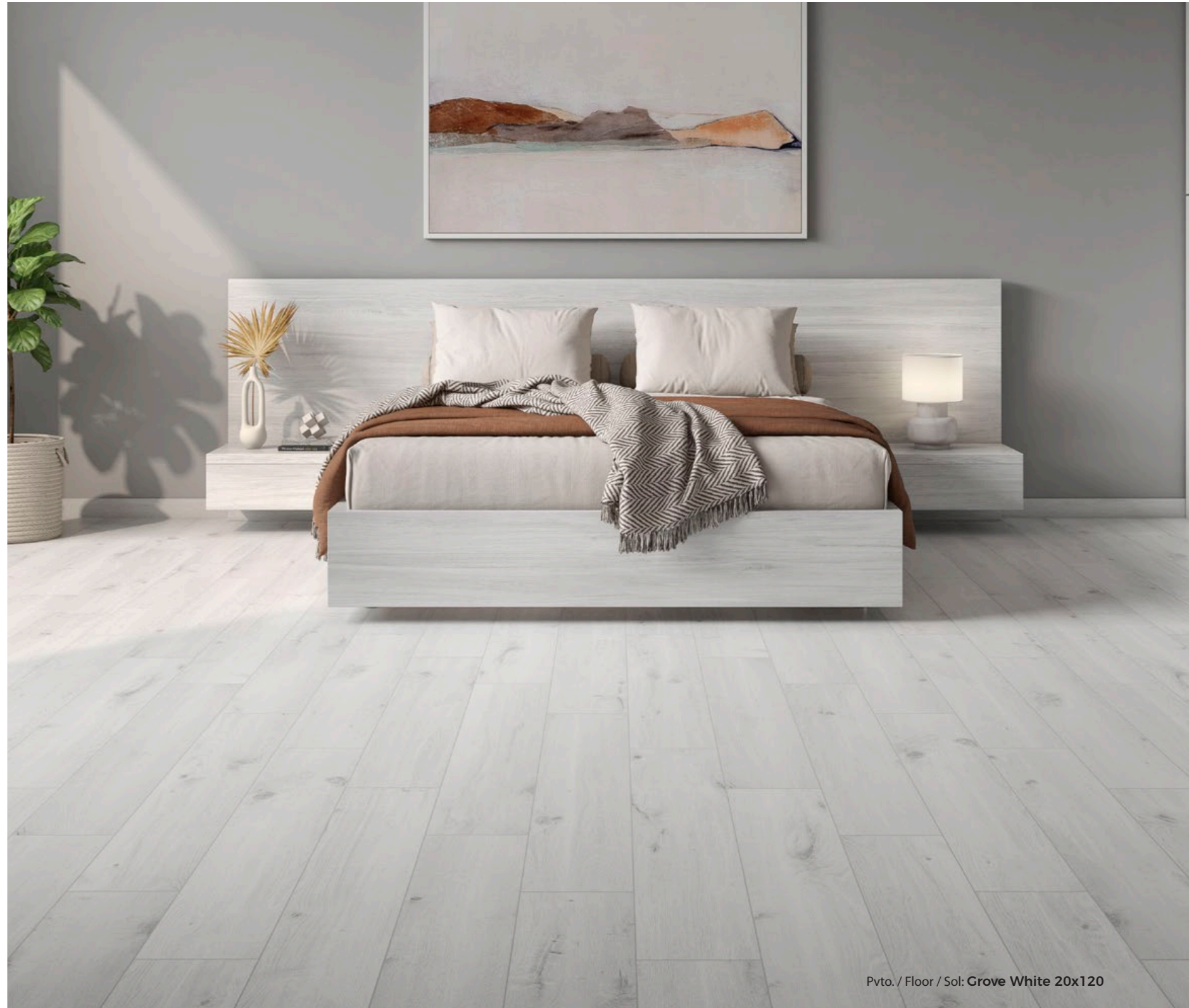
Pvto. / Floor / Sol: Grove White 20x120